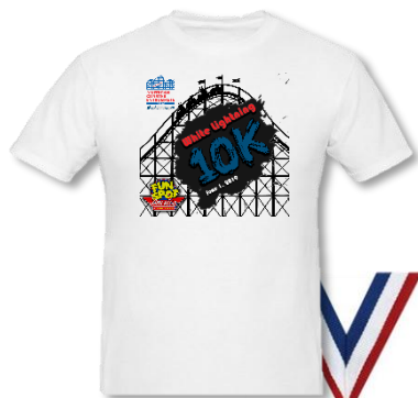
Plus Size Extra Charge